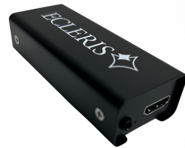
Optional digital capturing System Endodigi