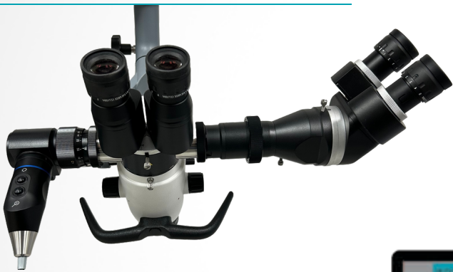
Adaptor for digital camera